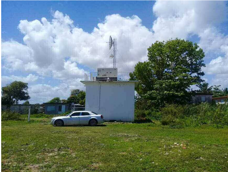
WEGA Transmitter Site Building