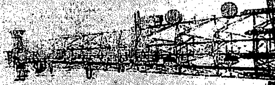
EXHIBIT 3 - PHOTO OF KQCC TOWER SITE