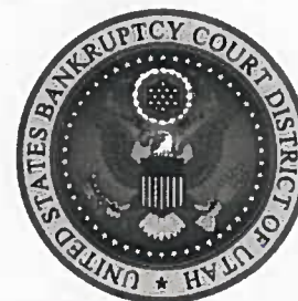
WILLIAM T. THURMAN U.S. Bankruptcy Judge